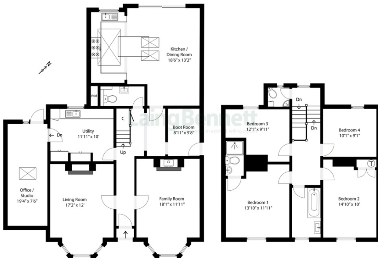
Illustration for identification purposes only. Measurements are approximate. Dimensions given are between the widest points. Not to scale. Outbuildings are not shown in actual location.

Approximate Gross Internal Area (Including Low Ceiling) = 185 sq m / 1993 sq ft