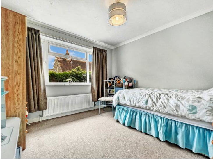
10' 8" x 10' 4" (3.25m x 3.15m)