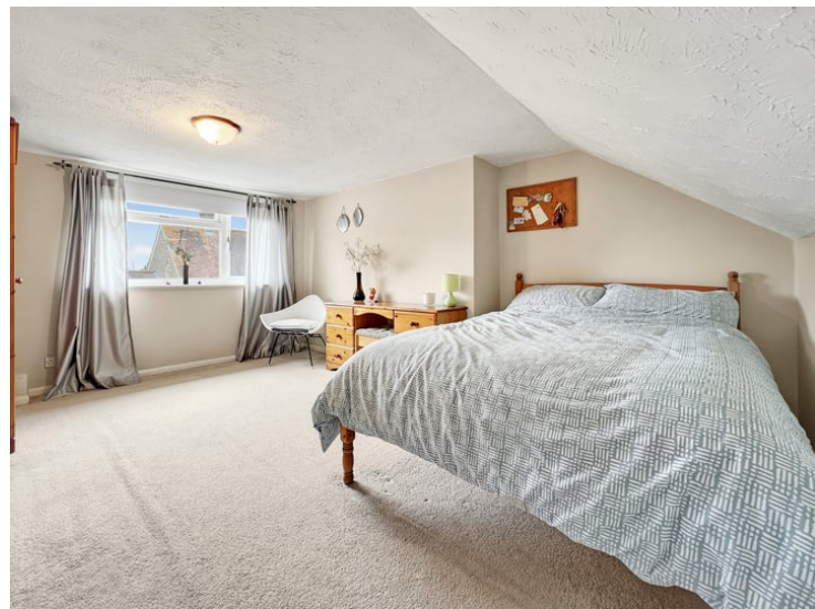
14' 8" x 11' 7" (4.47m x 3.53m)