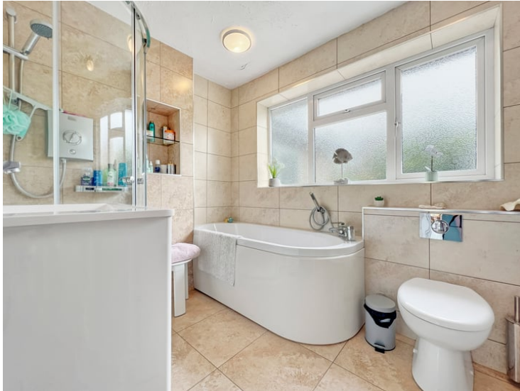
8' 4" x 7' 5" (2.54m x 2.26m)