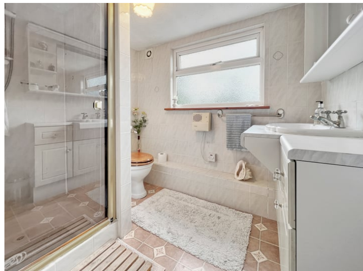
7' 3" x 6' 2" (2.21m x 1.88m)