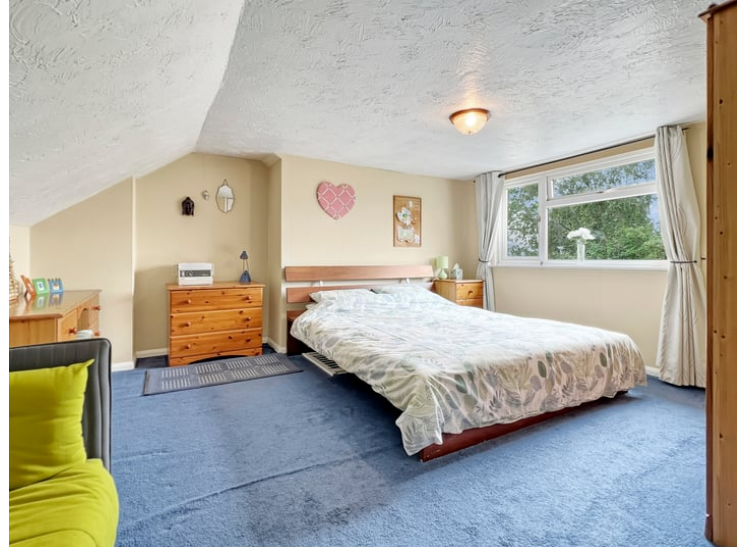
14' 5" x 14' 4" (4.39m x 4.37m)