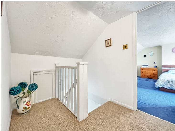
8' 1" x 5' 11" (2.46m x 1.80m)