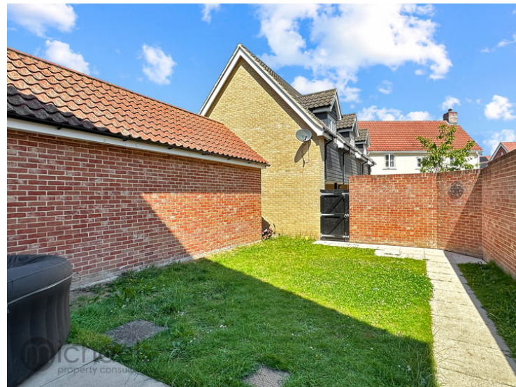
Outside offers a low maintenance garden which is predominantly laid to lawn and laid to patio. The garden is fully enclosed by a brick wall with gated rear access to the rear, providing a double car port and allocated parking multiple vehicles.