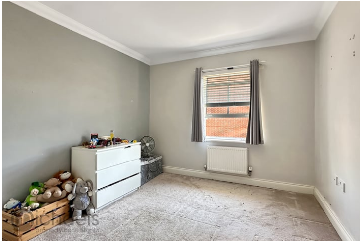
11' 0" x 9' 9" (3.35m x 2.97m) UPVC window to front, built in cupboard, radiator.