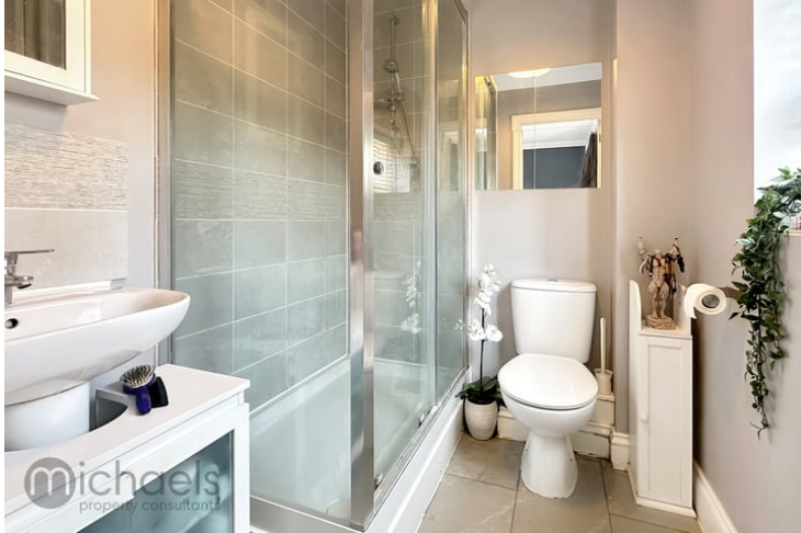
UPVC window to front, Low level WC, pedestal wash hand basin, double walk in shower, part tiled walls tiled floor, radiator.