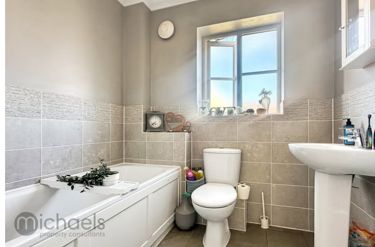
UPVC window to side, Low level WC, pedestal wash hand basin, panellled bath with shower attachment over, part tiled walls, tiled floor, radiator.