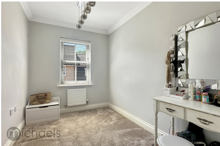
9' 9" x 6' 9" (2.97m x 2.06m) UPVC window to side, radiator.