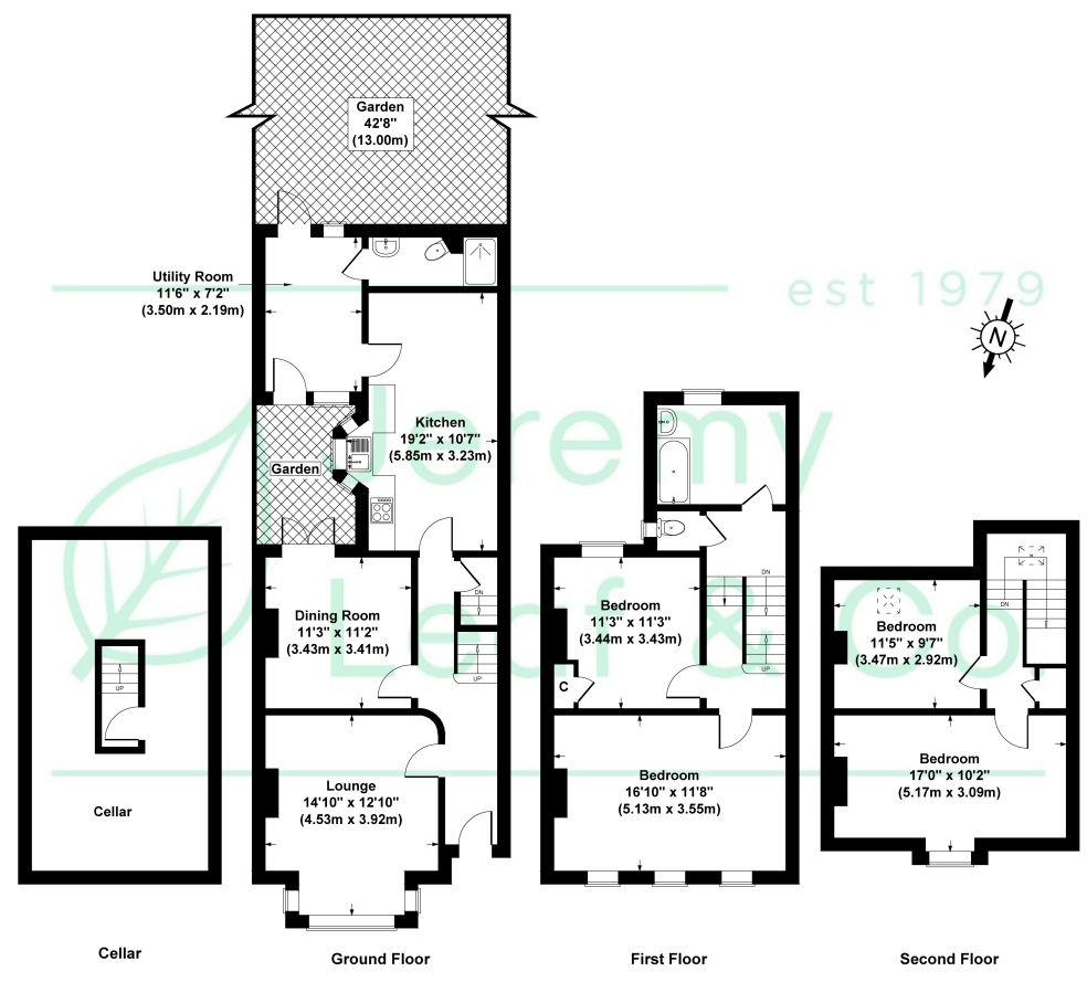
Lincoln Road, London, N2 Gross Internal Area 1604 sq ft / 149 sq metres (Excludes Cellar) Not to Scale. Produced by The Plan Portal 2024 For Illustrative Purposes Only.