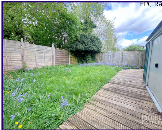
EPC Rating: D (60)

Don't miss the chance to make this lovely bungalow your home sweet home! Schedule a viewing now to appreciate what this property has to offer.