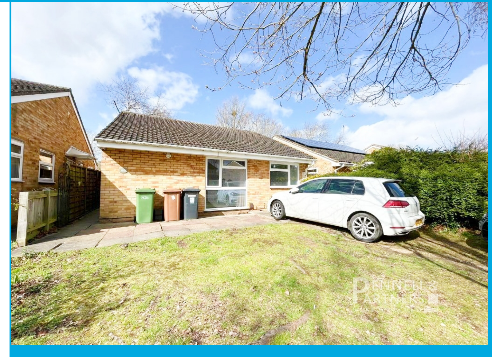
107 TOLLGATE, BRETTON, PETERBOROUGH, CAMBRIDGESHIRE. PE3 9XB