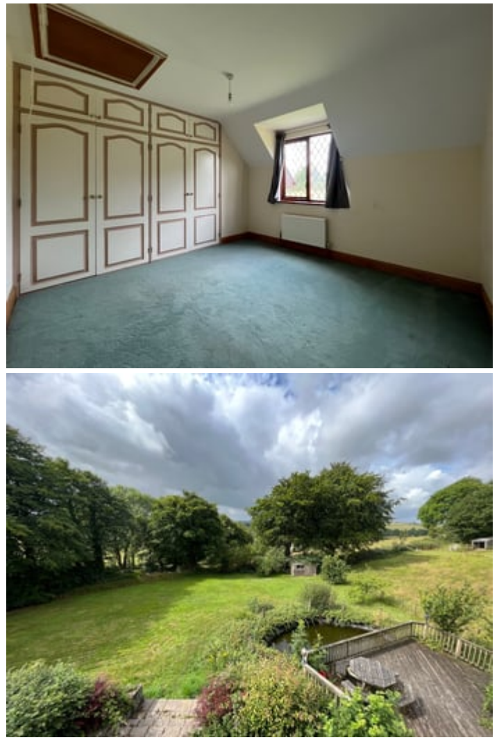
11' 6" x 14' 8" (3.51m x 4.47m) double bedroom, dual aspect windows to rear and side overlooking adjoining fields, fitted wardrobes, radiator, multiple sockets.