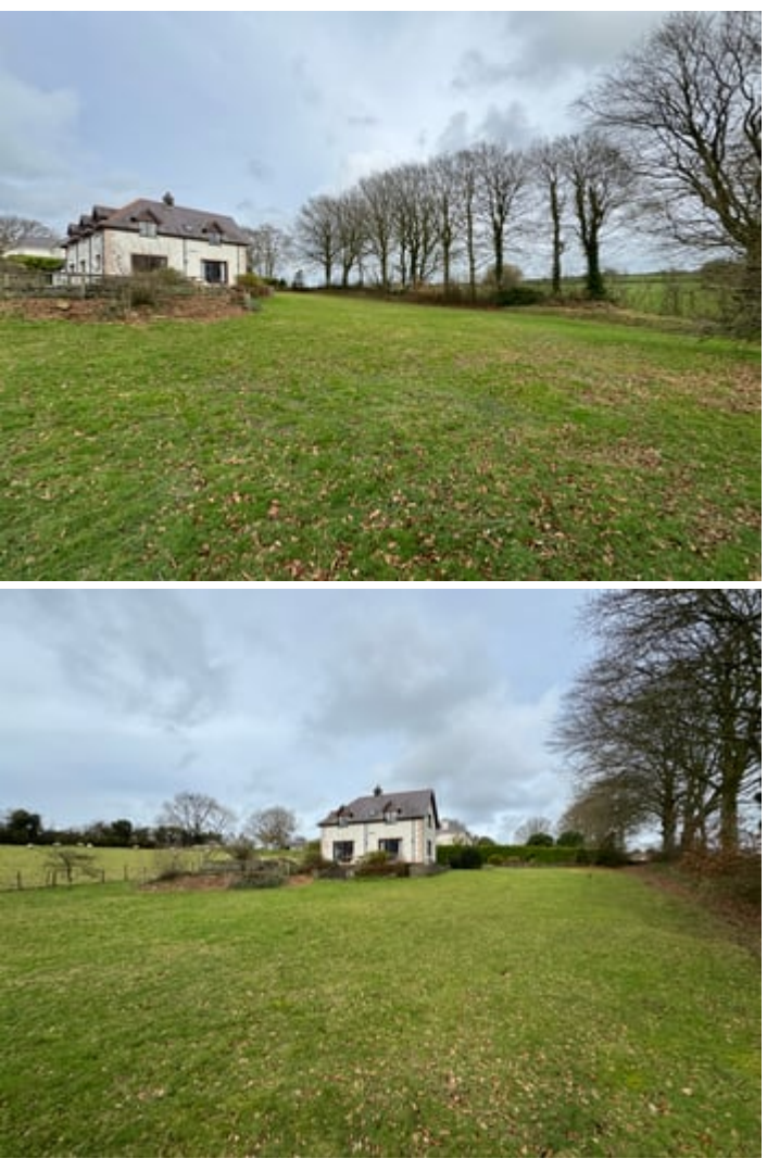
The property is approached via the adjoining county road through a pillared and gated entrance to a brick pave yard driveway leading to the front door and to the double garage with steps down to large extending front lawn area with mature planting to borders and wonderful tree line boundary with the adjoining road.

Side footpath leading onto raised side patio, also accessible from the lounge and dining room patio doors, being elevated and overlooking the adjoining garden to the side as well as the custom made fish pond with decking area and seating space fully orientated to maximise the outlook over the garden and adjoining countryside.