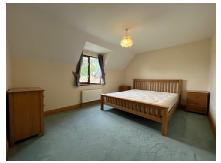
10' 7" x 13' 7" (3.23m x 4.14m) double bedroom, rear window overlooking adjoining fields, multiple sockets, radiator.