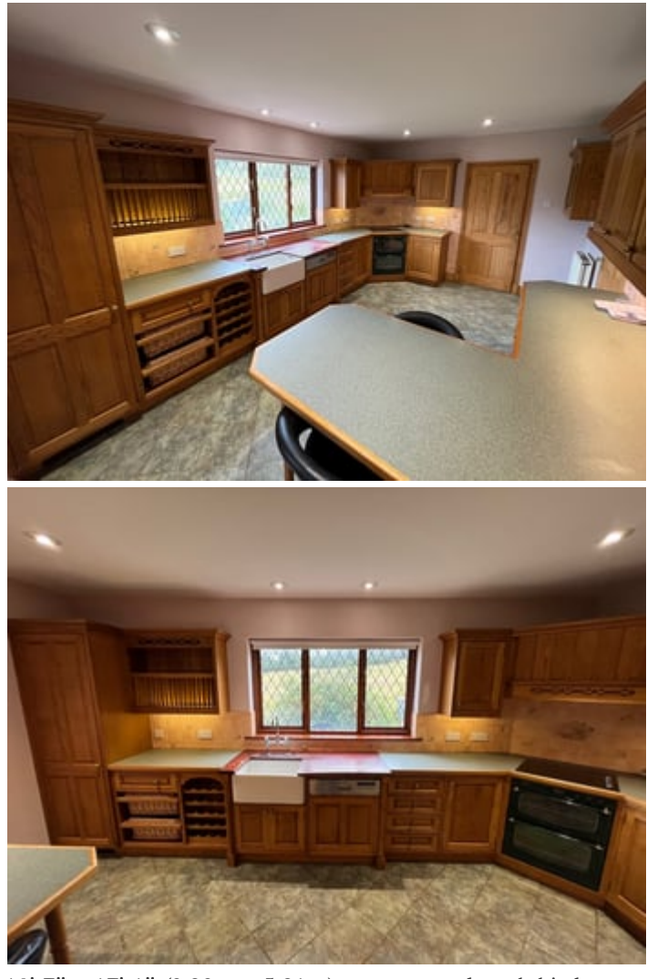
10' 7" x 17' 1" (3.23m x 5.21m) custom made oak kitchen with Formica worktop, Belfast sink with mixer tap, fitted Stoves oven and grill, electric hobs with extractor over, tiled splashback, fitted dishwasher, fitted fridge/freezer, breakfast bar with seating area, rear window to garden, tiled flooring, radiator, multiple sockets, open plan into dining room.