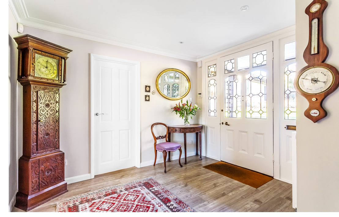
The Garden House, Brasted Chart, Brasted, Kent TN16 1LW £1,850,000 - Freehold