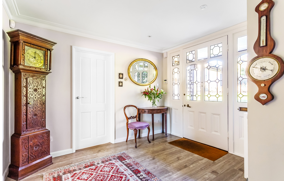
The Garden House, Brasted Chart, Brasted, Kent TN16 1LW £1,850,000 - Freehold