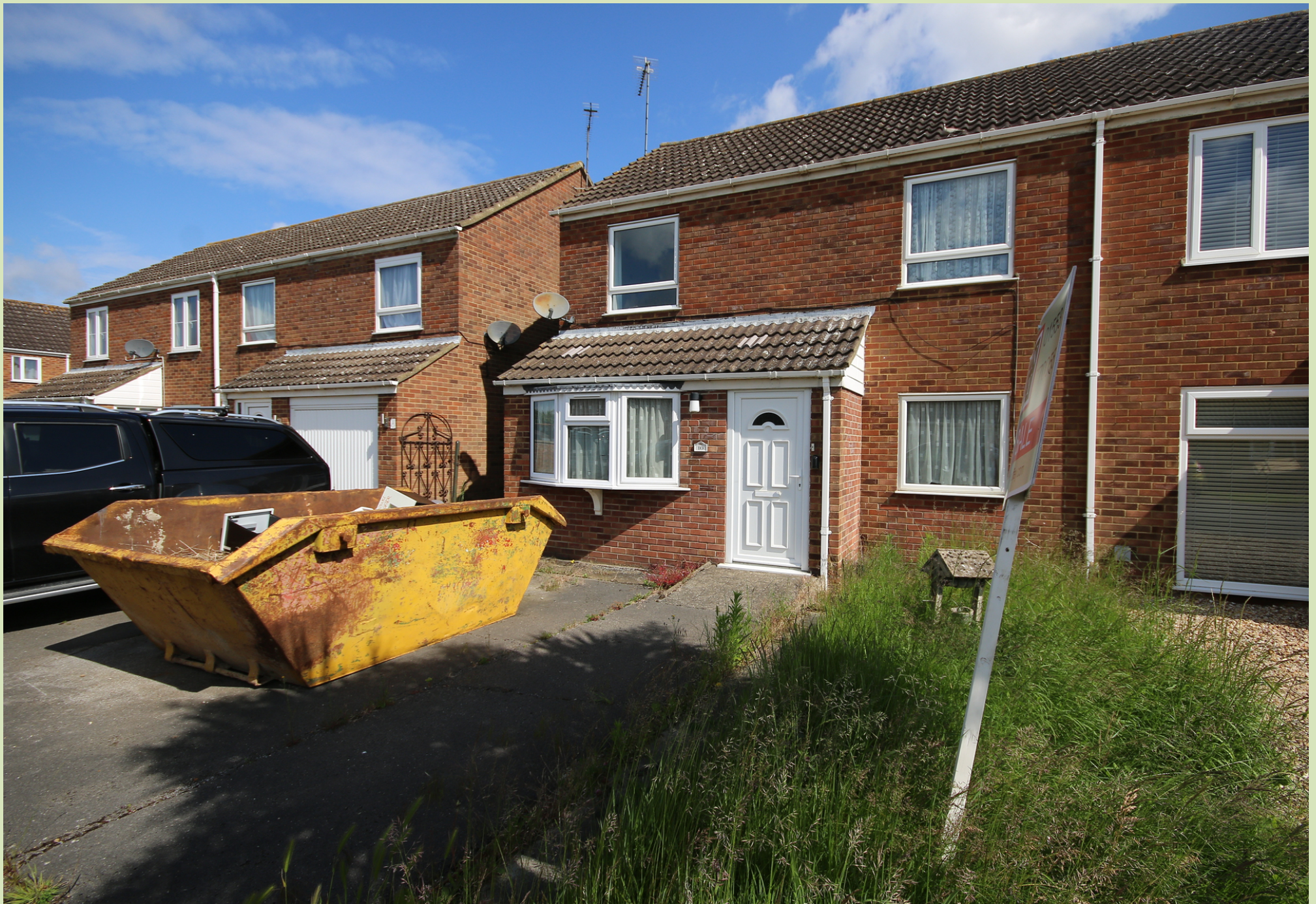
10 The Burnhams, Terrington St Clement Guide Price £225,000