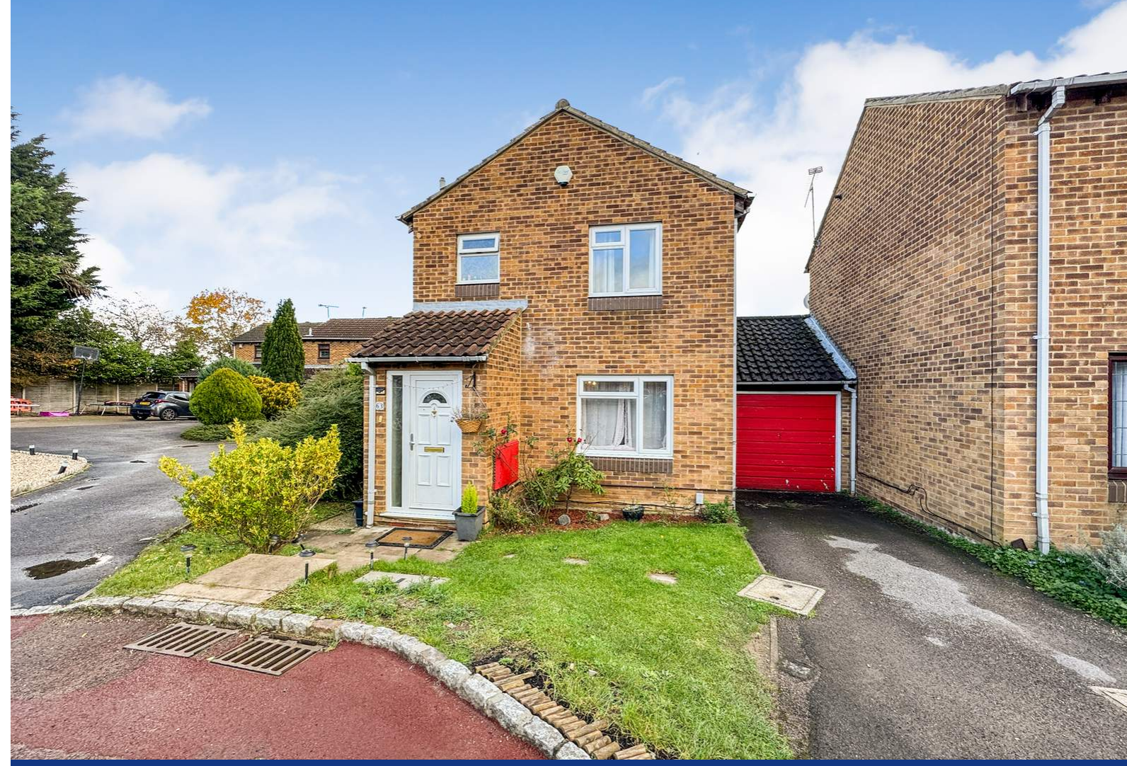
Chilcombe Way, Lower Earley, Reading, Berkshire. RG6 3DB.