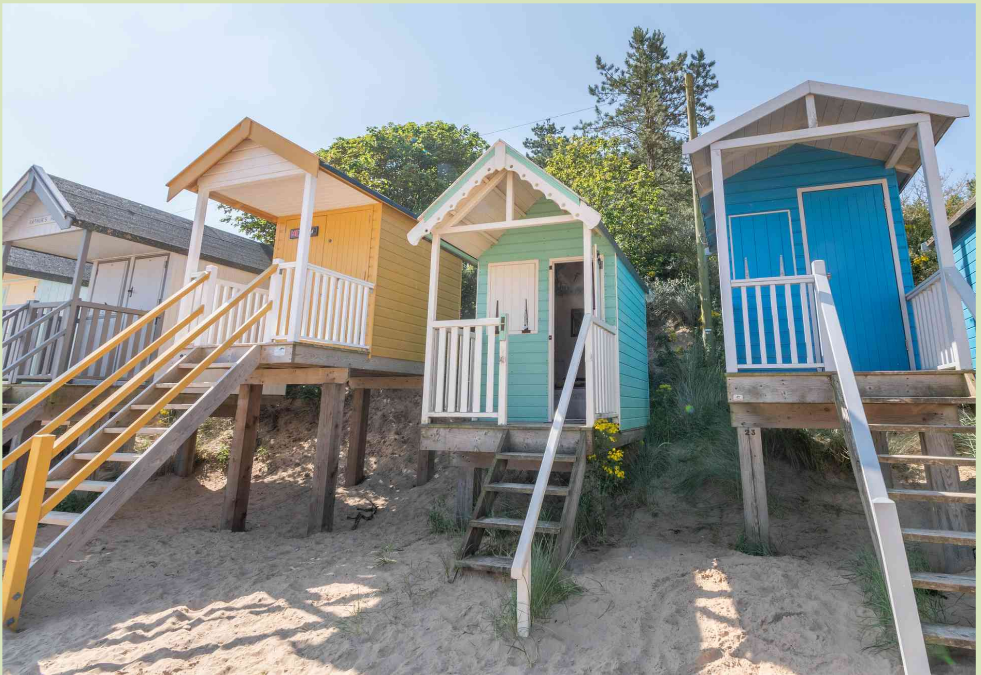
Beach Hut 22, Wells-next-the-Sea Guide Price £77,500