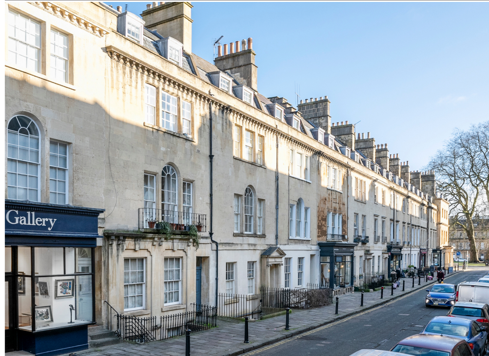
Brock Street, Bath