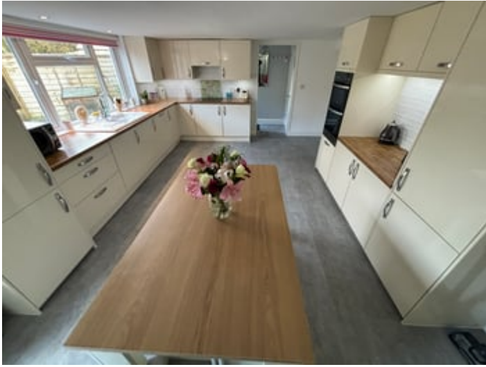
KITCHEN (SECOND IMAGE)

21' 7" x 13' 6" (6.58m x 4.11m). A modern fitted Kitchen with a range of wall and floor units with work surfaces over, ceramic 1 1/2 sink and drainer unit, fitted double oven, ceramic hob with extractor hood over, integrated dishwasher and fridge/freezer, French doors to the garden area.