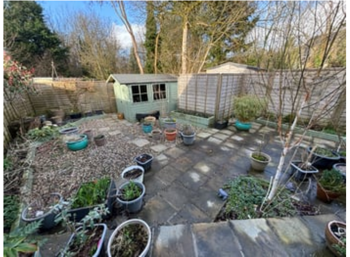
GARDEN (SECOND IMAGE)

The property enjoys an enclosed low maintenance garden area enjoying various patio areas with raised flower and shrub beds. It enjoys a side gated access point, all of which being enclosed and private.