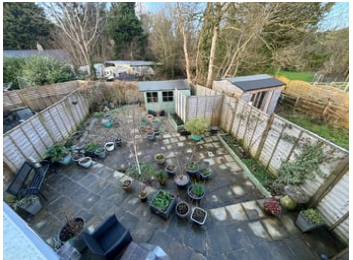
GARDEN (THIRD IMAGE)