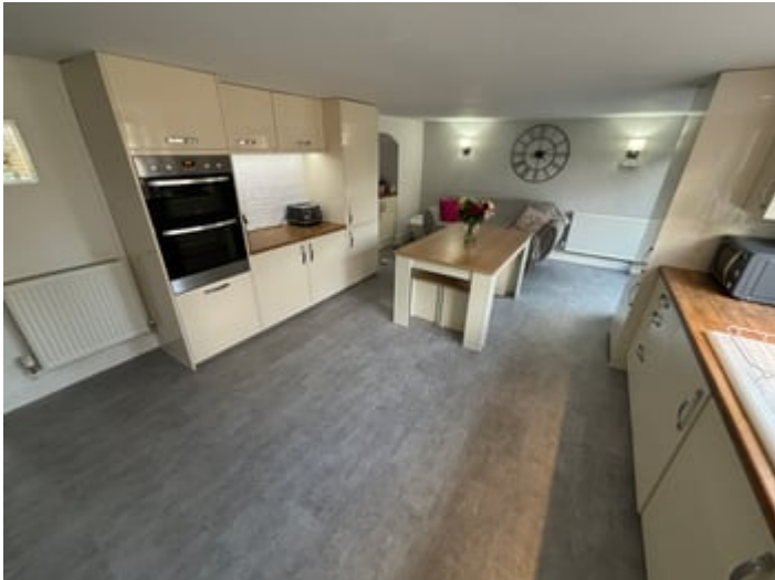
KITCHEN (THIRD IMAGE)