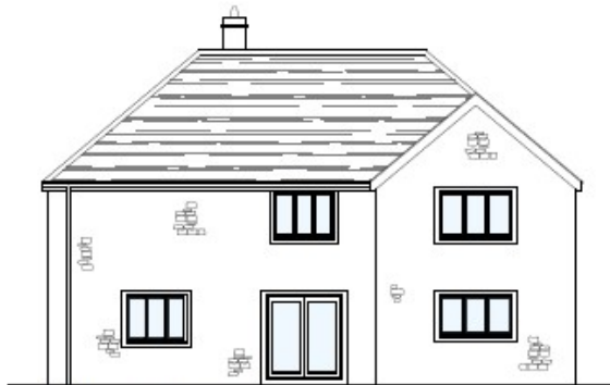
Southeast Elevation 1:100