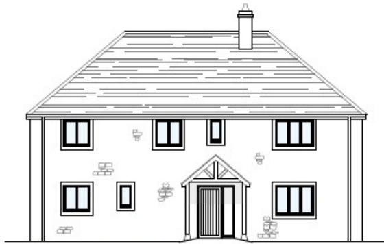
Northwest Elevation 1:100