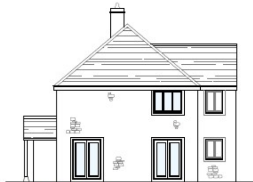
Southwest Elevation 1:100