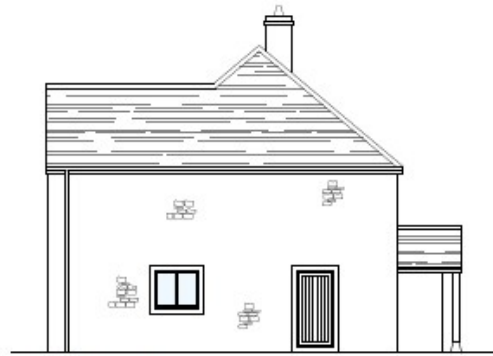
Northeast Elevation 1:100