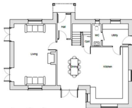
Ground Floor Plan 1:100