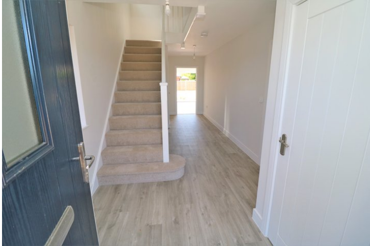
A spacious hallway with window to side, stairs to first floor, radiator, storage cupboard, LVT flooring and doors to.