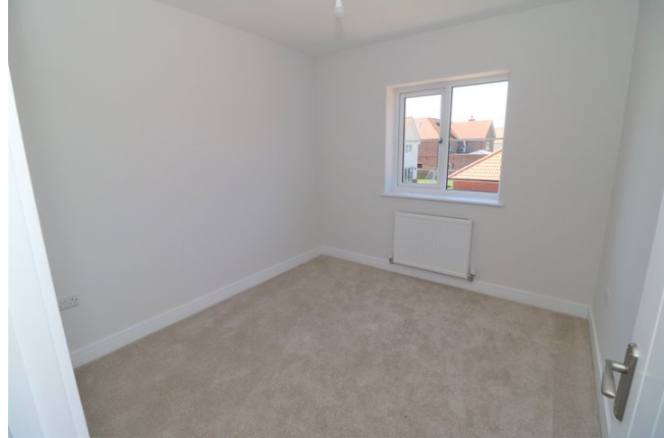
10' 1" x 9' 5" (3.07m x 2.87m) Window to rear and radiator