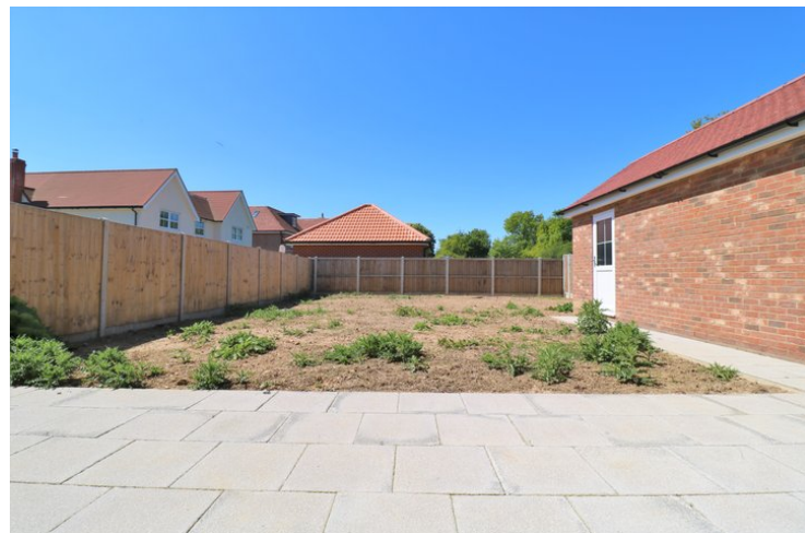
A generous rear garden, all enclosed by panel fencing with gated side access.