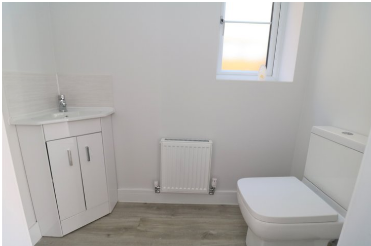
Close coupled WC, vanity wash hand basin, LVT flooring, radiator, window to side.