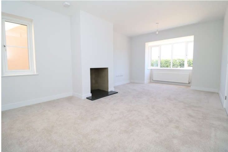
20' 1" x 11' 6" (6.12m x 3.51m) Box bay window to front, window to side, radiator, TV point, open fireplace.