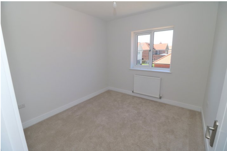
13' 7" x 9' 1" (4.14m x 2.77m) Window to rear and radiator