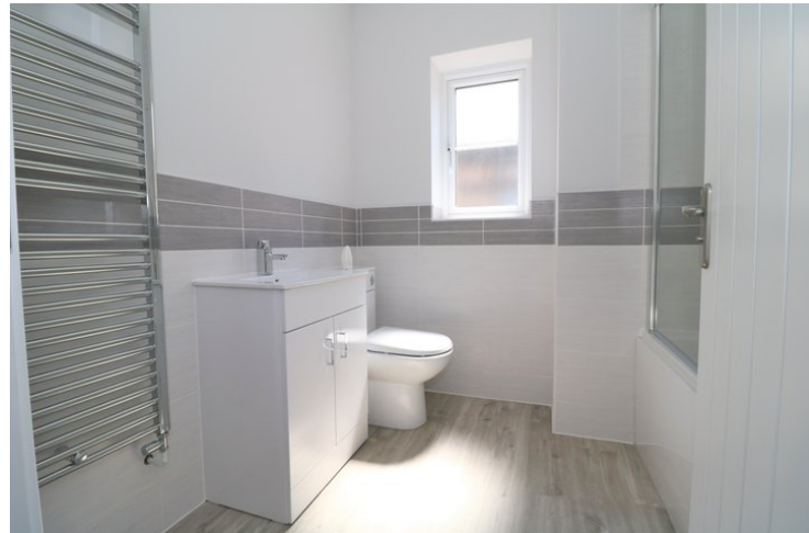
Obscure window to side, panel bath with shower screen, vanity wash hand basin, enclosed cistern WC, heated towel rail, tiled splash back, LVT flooring.