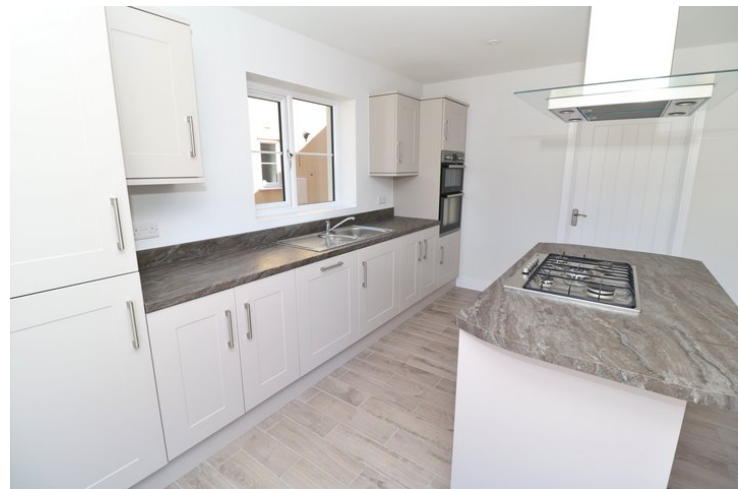
19' 0" x 13' 6" (5.79m x 4.11m) A bright room with 12' bi folding doors leading to the rear garden, windows to both sides, tiled wood effect flooring with heating under, a range of fitted units and drawers with worktops over, inset sink and drainer, double oven, integrated fridge/freezer, central island with breakfast bar worktop, inset gas hob, island extractor over, inset spotlights, door to utility room.