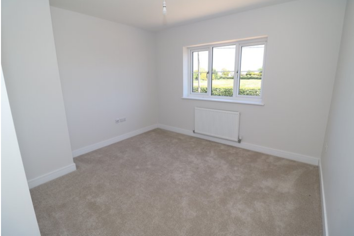
13' 11" x 11' 7" (4.24m x 3.53m) Plus dressing area, window to front offering field views, radiator, dressing area offering ample mirrored wardrobes and door to en-suite.