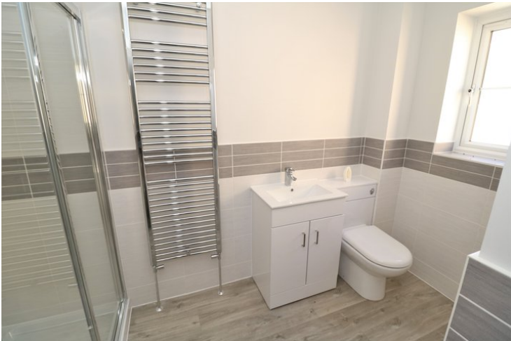
Obscure window to side, double shower cubicle, enclosed cistern WC, vanity wash hand basin, heated towel rail, LVT flooring, half tiled walls.