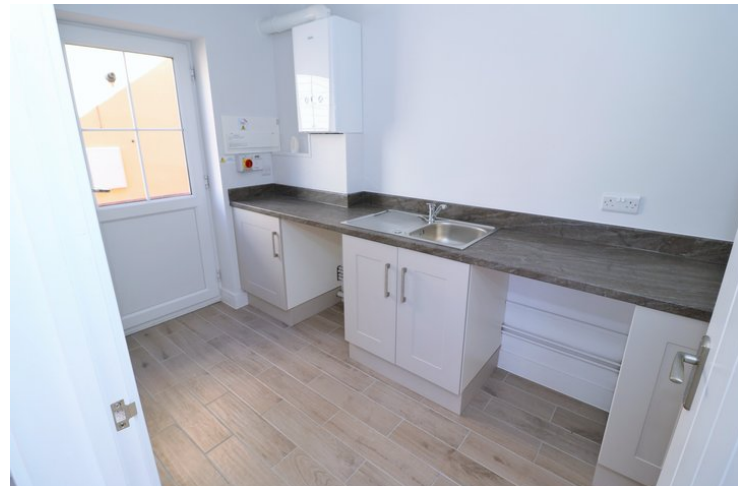
11' 2" x 6' 3" (3.40m x 1.91m) Door to side, tiled wood effect flooring, a range of fitted units and drawers with worktops over, inset sink and drainer, matching eye level units, spaces for appliances.