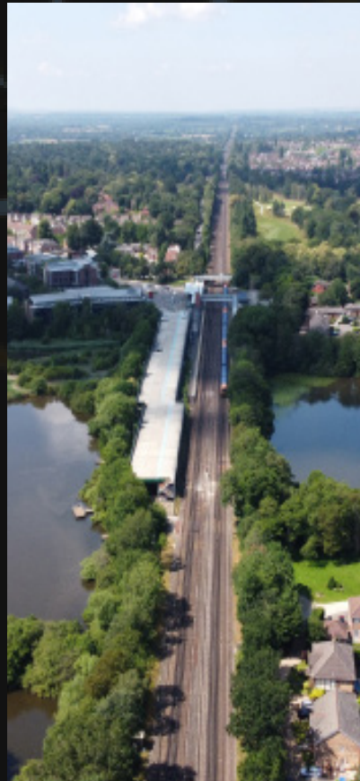
Rail Line/Fleet Pond