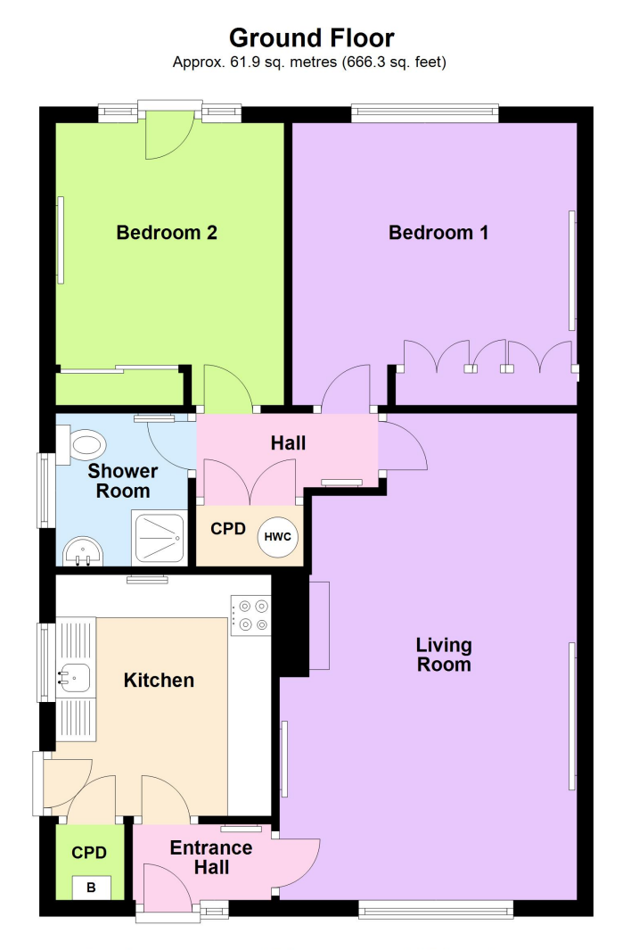
Total area: approx. 61.9 sq. metres (666.3 sq. feet)