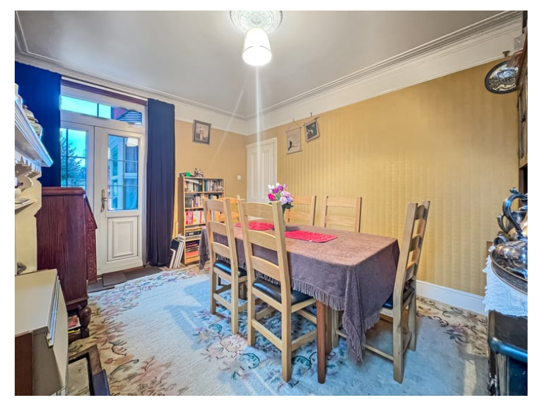
13' 6" x 10' 8" (4.11m x 3.25m)