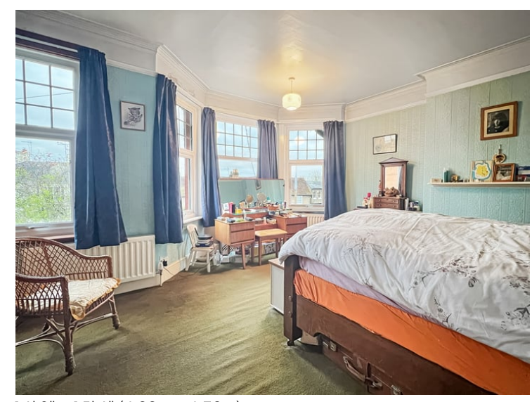
16' 0" x 15' 6" (4.88m x 4.72m)