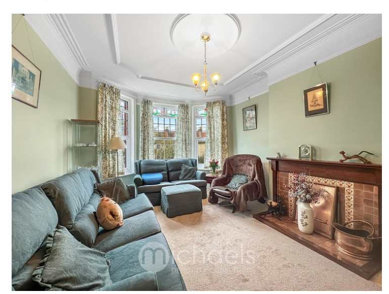
15'6" x 11'3" (4.72m x 3.43m)