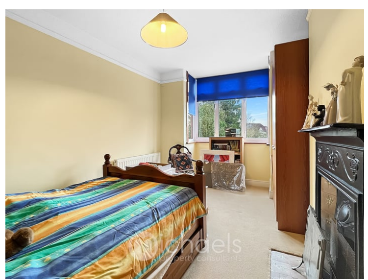
15' 4" x 9' 7" (4.67m x 2.92m)