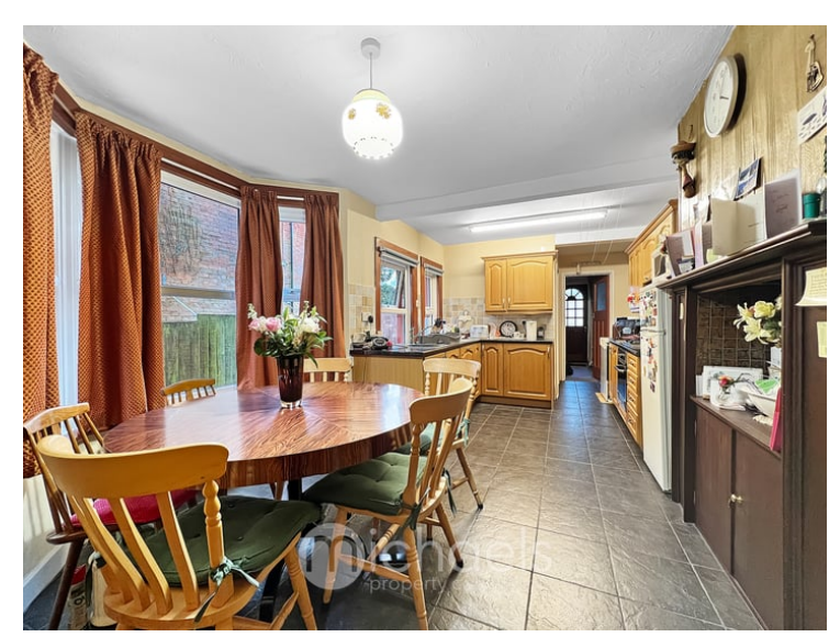
24' 3" (Max) x 9' 6" (7.39m x 2.90m)