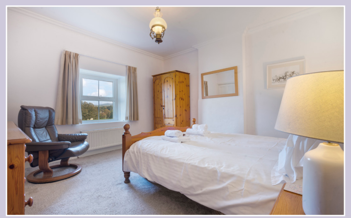
CA13 9SJ Broadband

All offers should be made to the Agents, Edwin Thompson Property Services Limited.