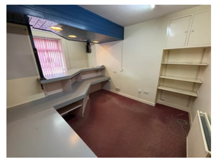
15' 8" x 10' 7" (4.78m x 3.23m) with fitted counter. Understairs store. Radiator.