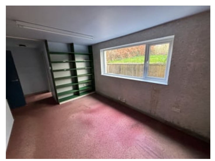
21' 10" x 9' 5" (6.65m x 2.87m) with fitted units. Radiator.