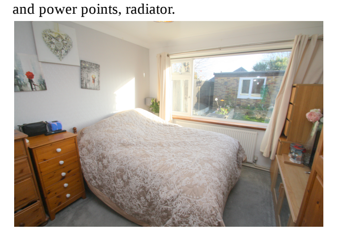
Bedroom 2 Front aspect UVPC double glazed window, light and power points, radiator.