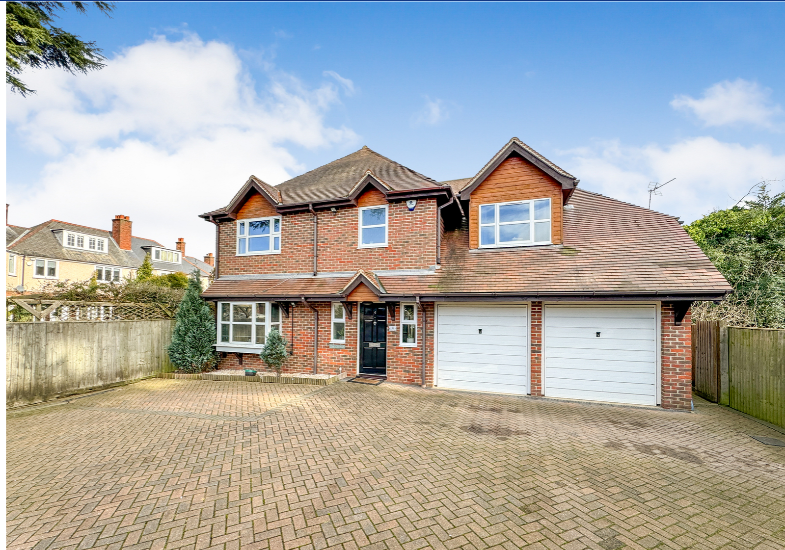
Bexley Court, Reading, Berkshire.