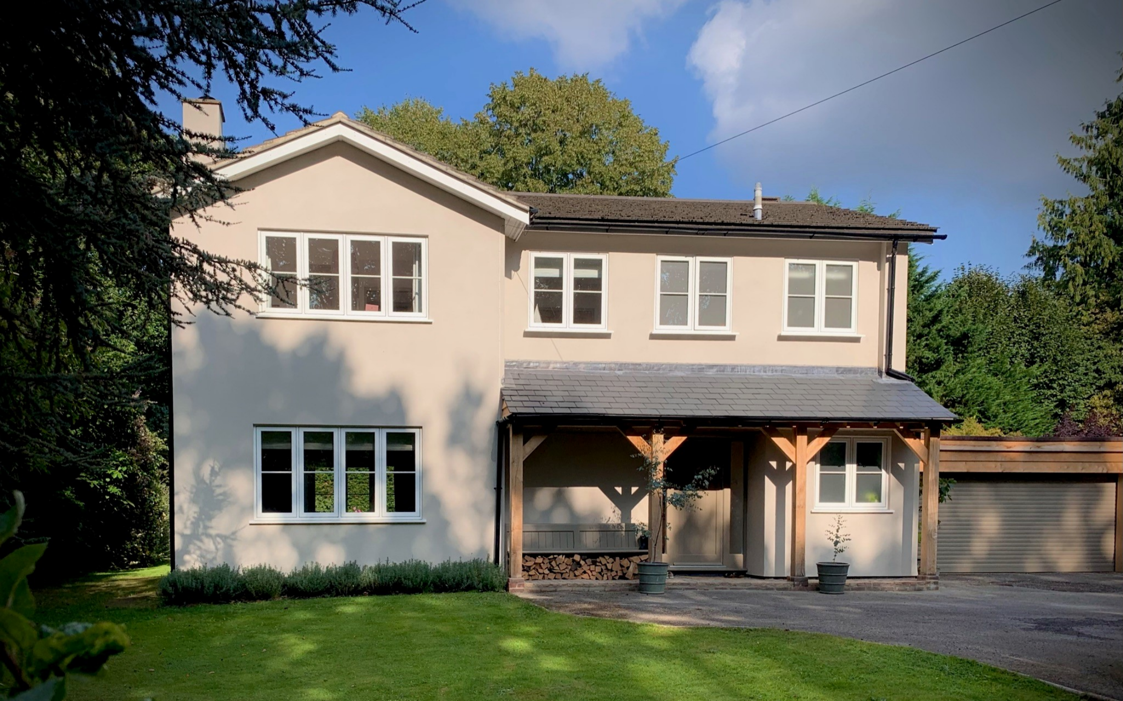
Ash House, Crossways, Churt, Farnham, Surrey. GU10 2JU. Guide Price £950,000