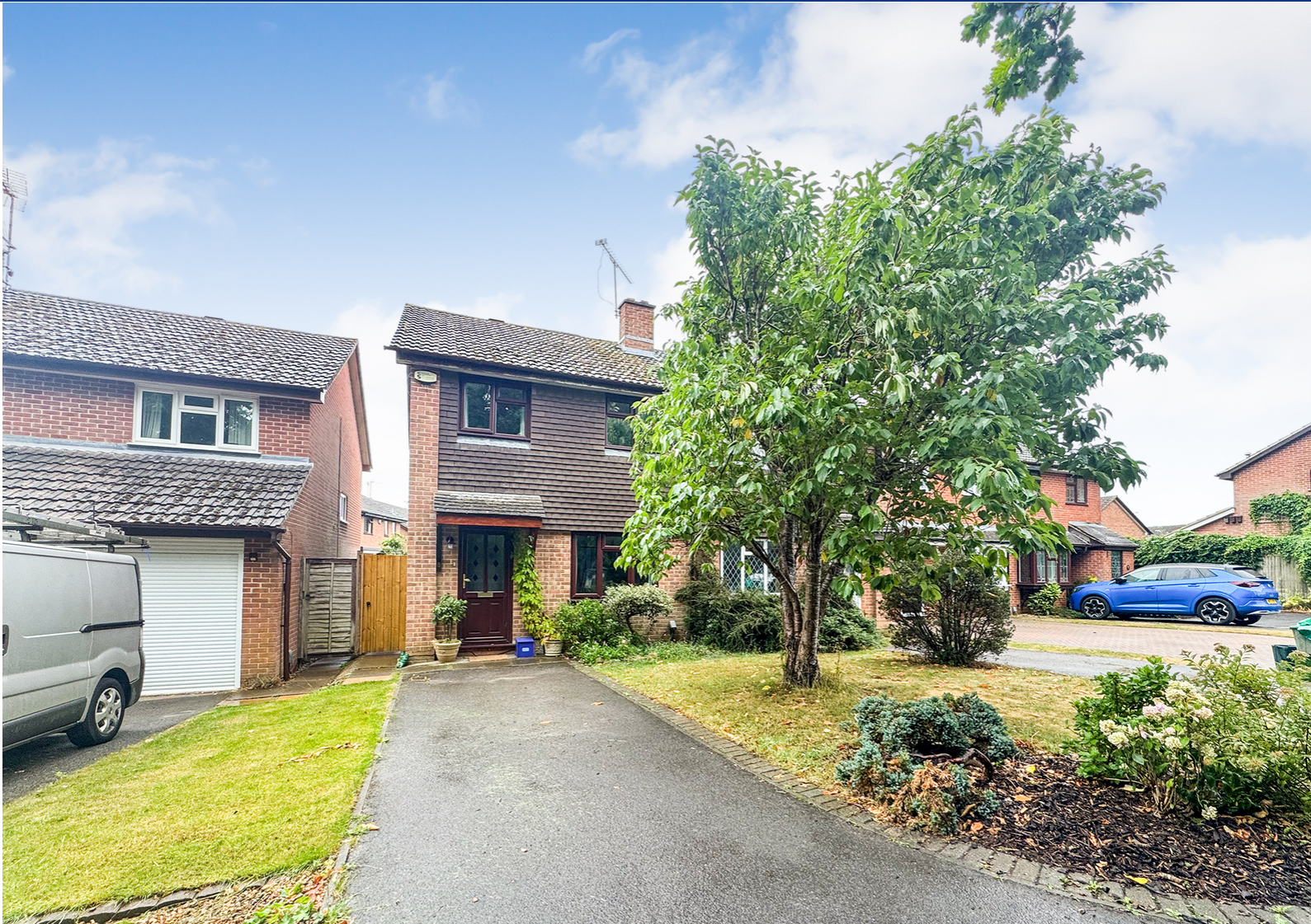
Home Croft, Tilehurst, Reading, Berkshire. RG31.