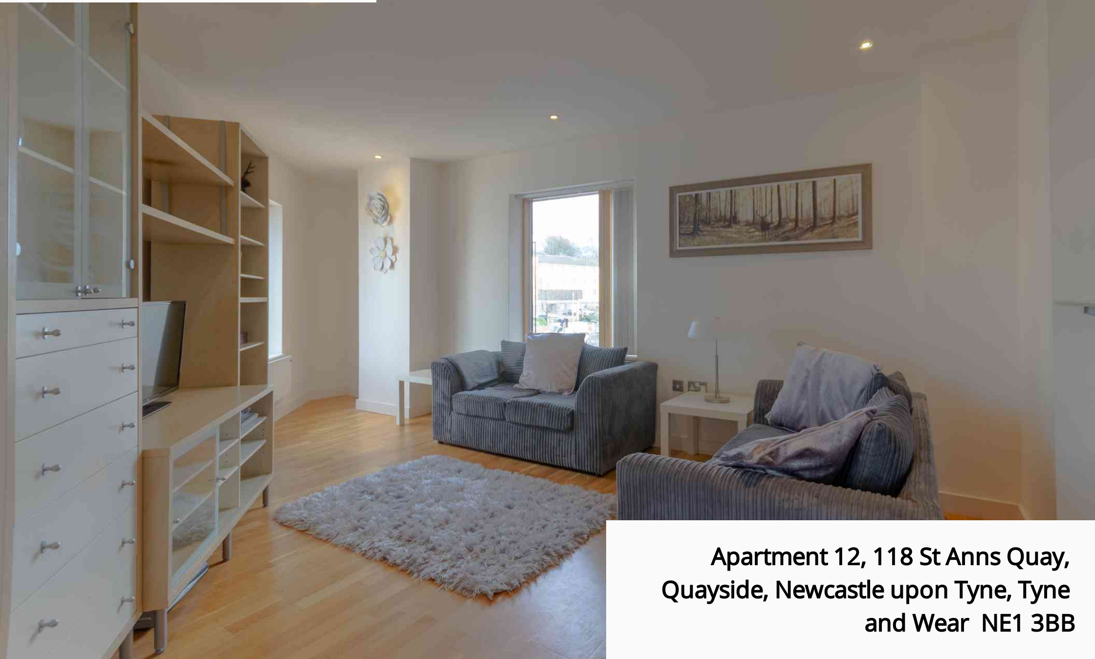
Apartment 12, 118 St Anns Quay, Quayside, Newcastle upon Tyne, Tyne and Wear NE1 3BB