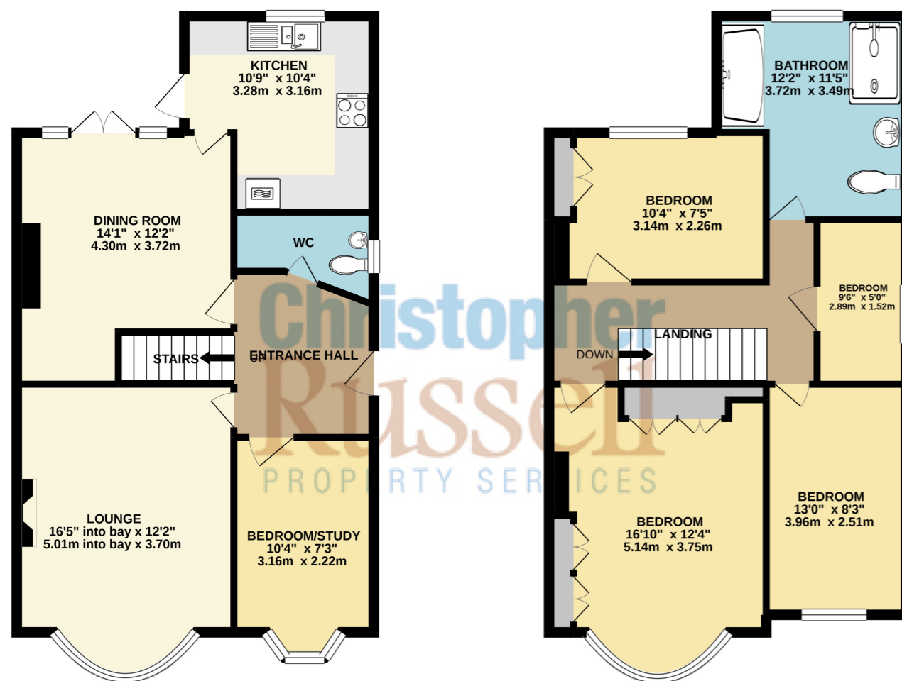
1ST FLOOR 632 sq.ft. (58.7 sq.m.) approx.

TOTAL FLOOR AREA : 1273 sq.ft. (118.3 sq.m.) approx.