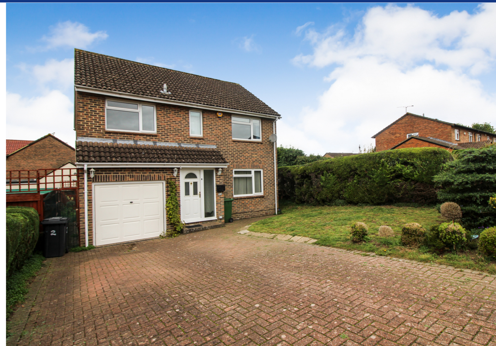
Torcross Grove, Calcot, Reading.