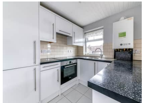
Melfort Road, Thornton Heath, Surrey, CR7