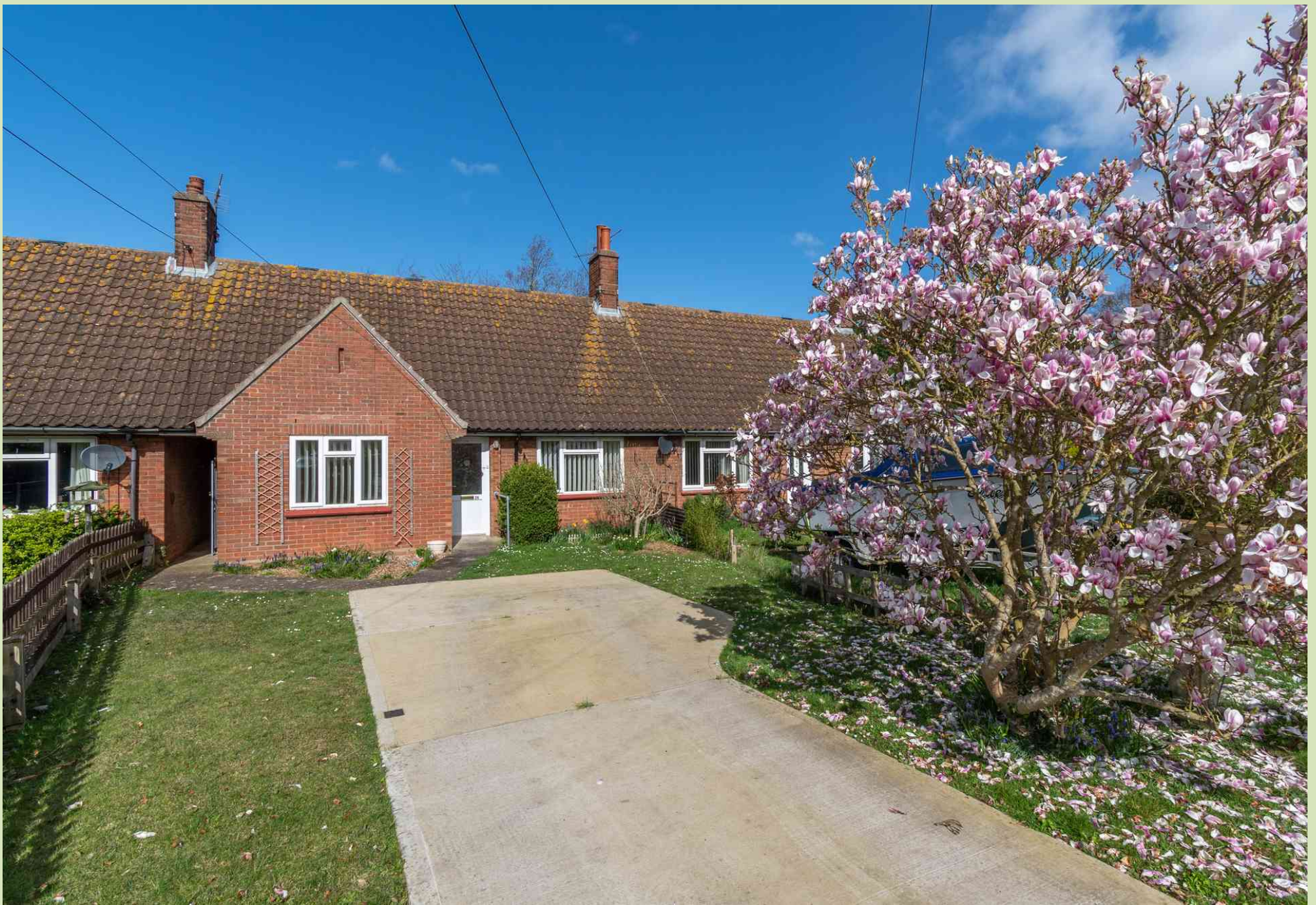
26 Priory Crescent, Binham Guide Price £220,000