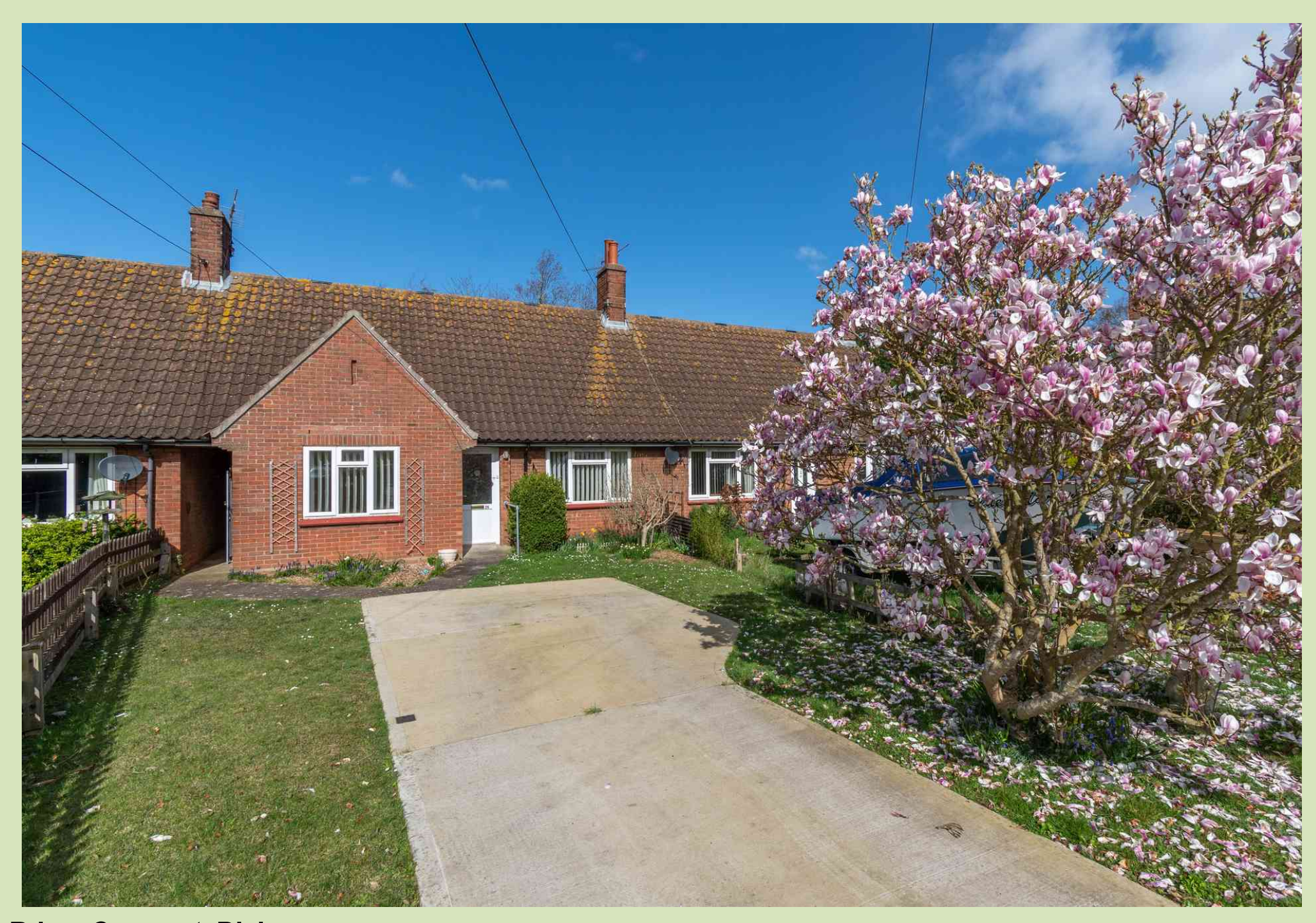
26 Priory Crescent, Binham Guide Price £220,000