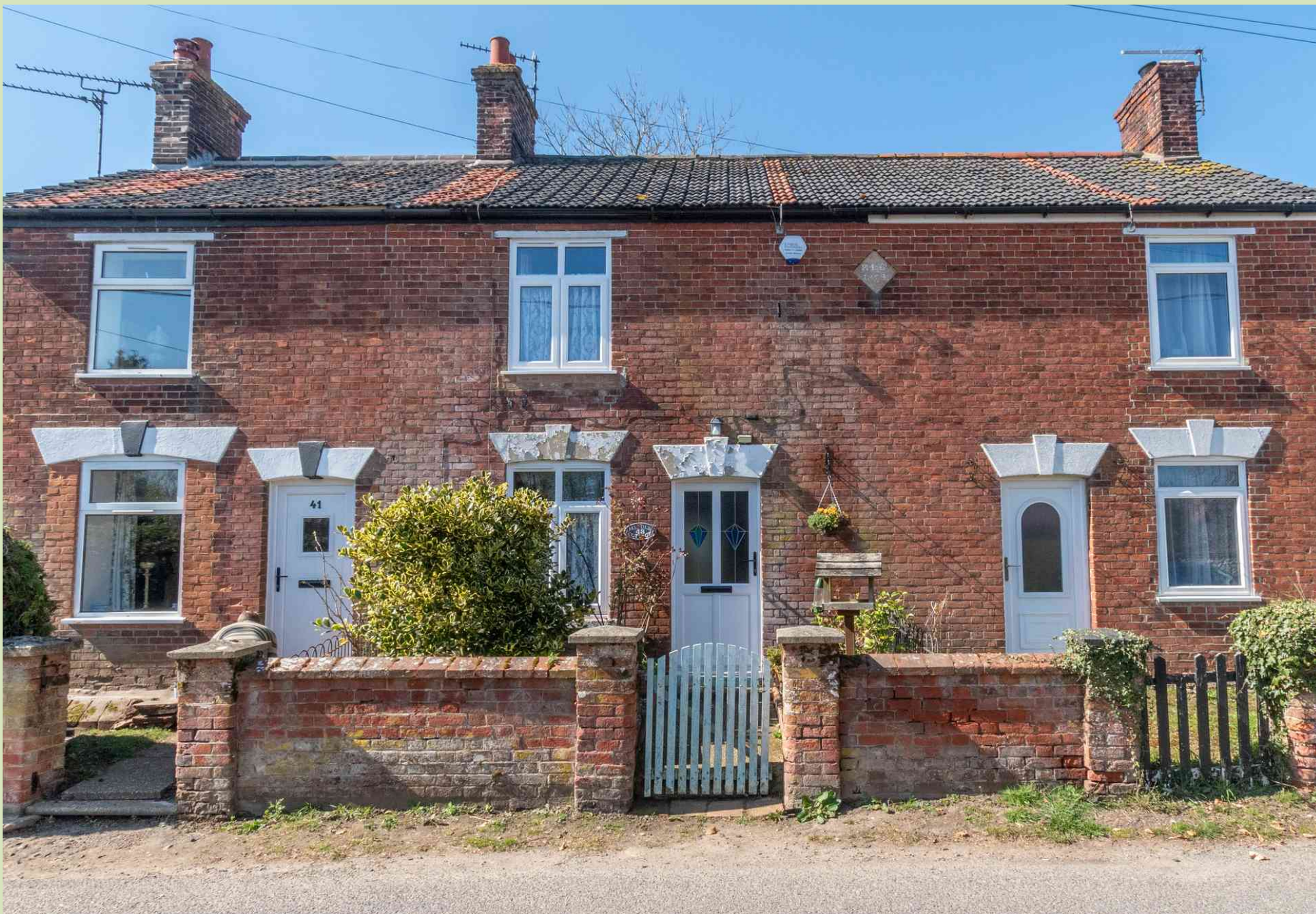
Middle Cottage, Barney Guide Price £250,000