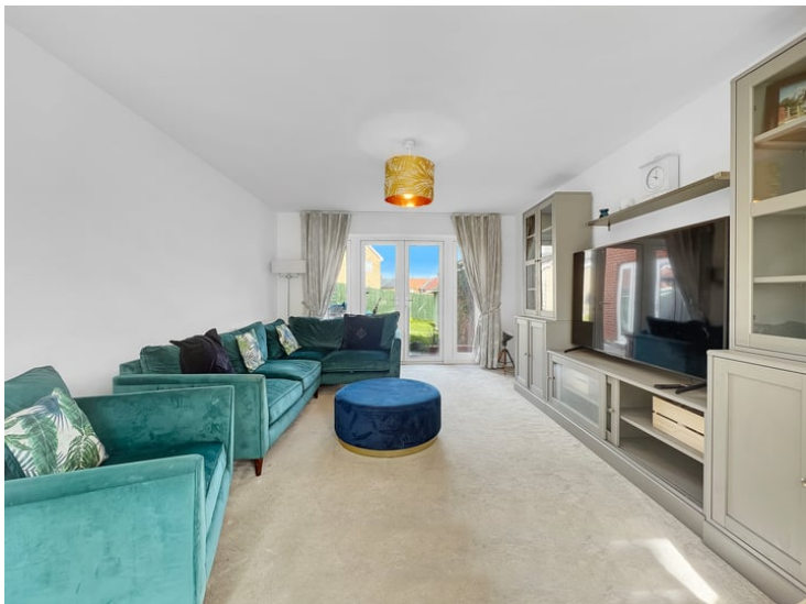
18' 8" x 12' 2" (5.69m x 3.71m)