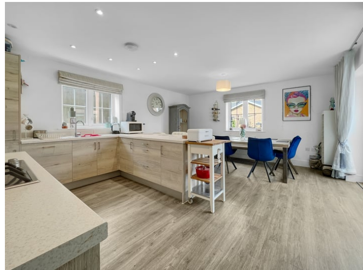
15' 0" x 9' 6" (4.57m x 2.90m)