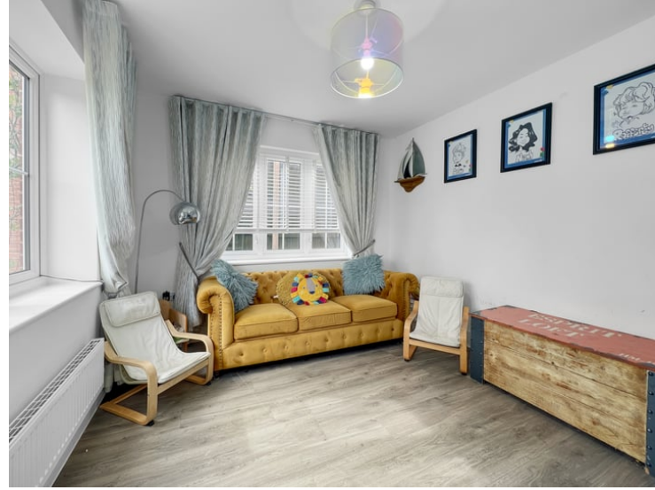
11' 0" x 9' 9" (3.35m x 2.97m)