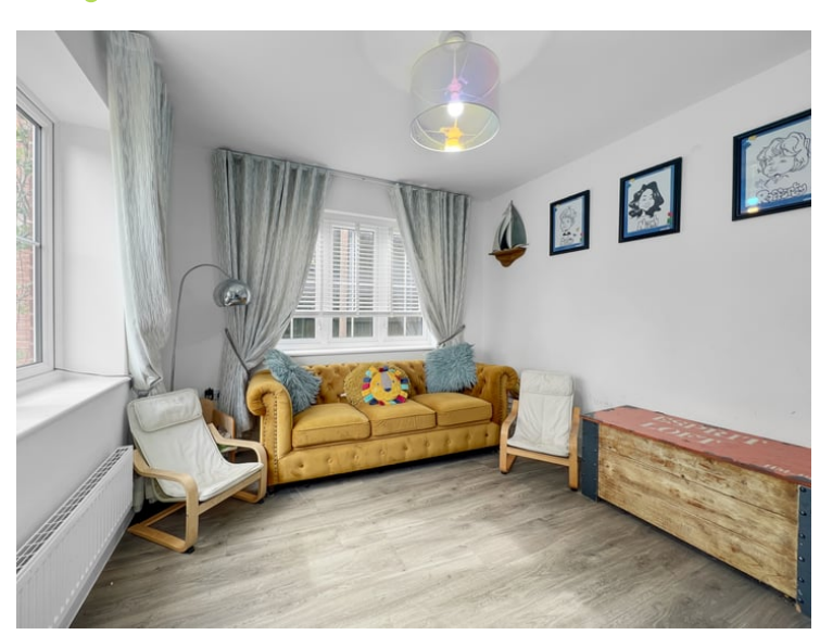
11'0" x 9' 9" (3.35m x 2.97m)