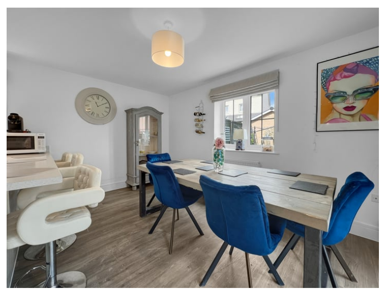
15'0" x 9'1" (4.57m x 2.77m)