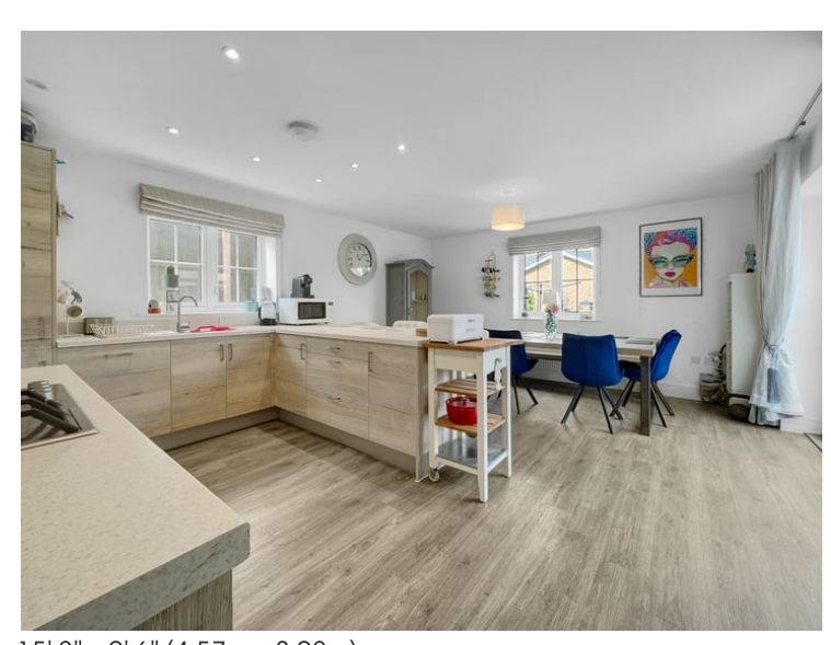
15' 0" x 9' 6" (4.57m x 2.90m)