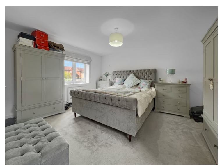
15' 0" x 12' 1" (4.57m x 3.68m)