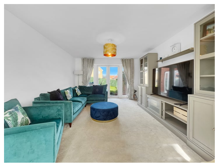
18' 8" x 12' 2" (5.69m x 3.71m)