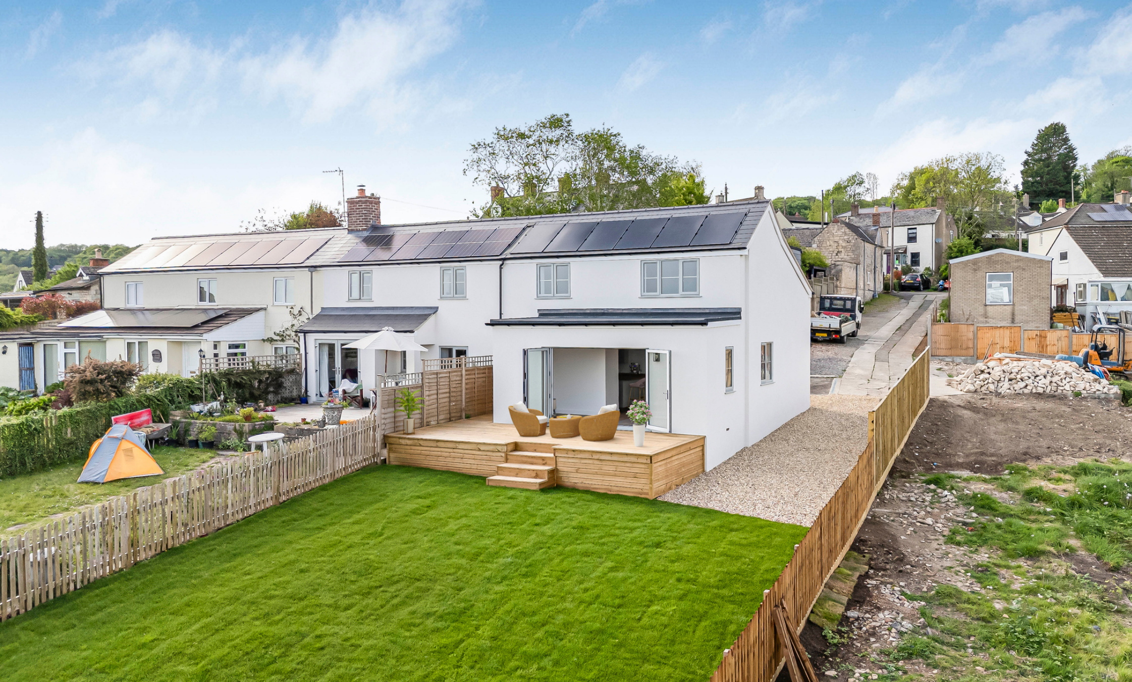
4 Ferndale Cottages, Victory Road, Whiteshill, Gloucestershire, GL6 6BA Price Guide £480,000