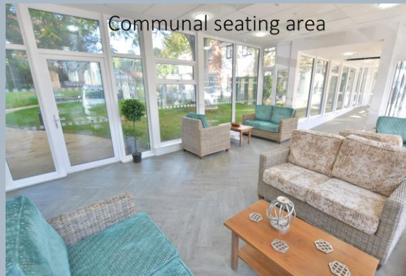
Communal seating area