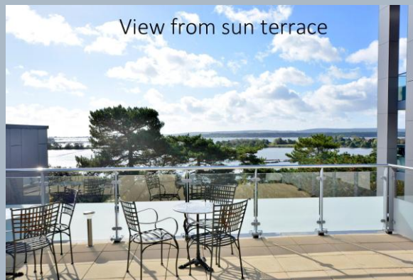
View from sun terrace