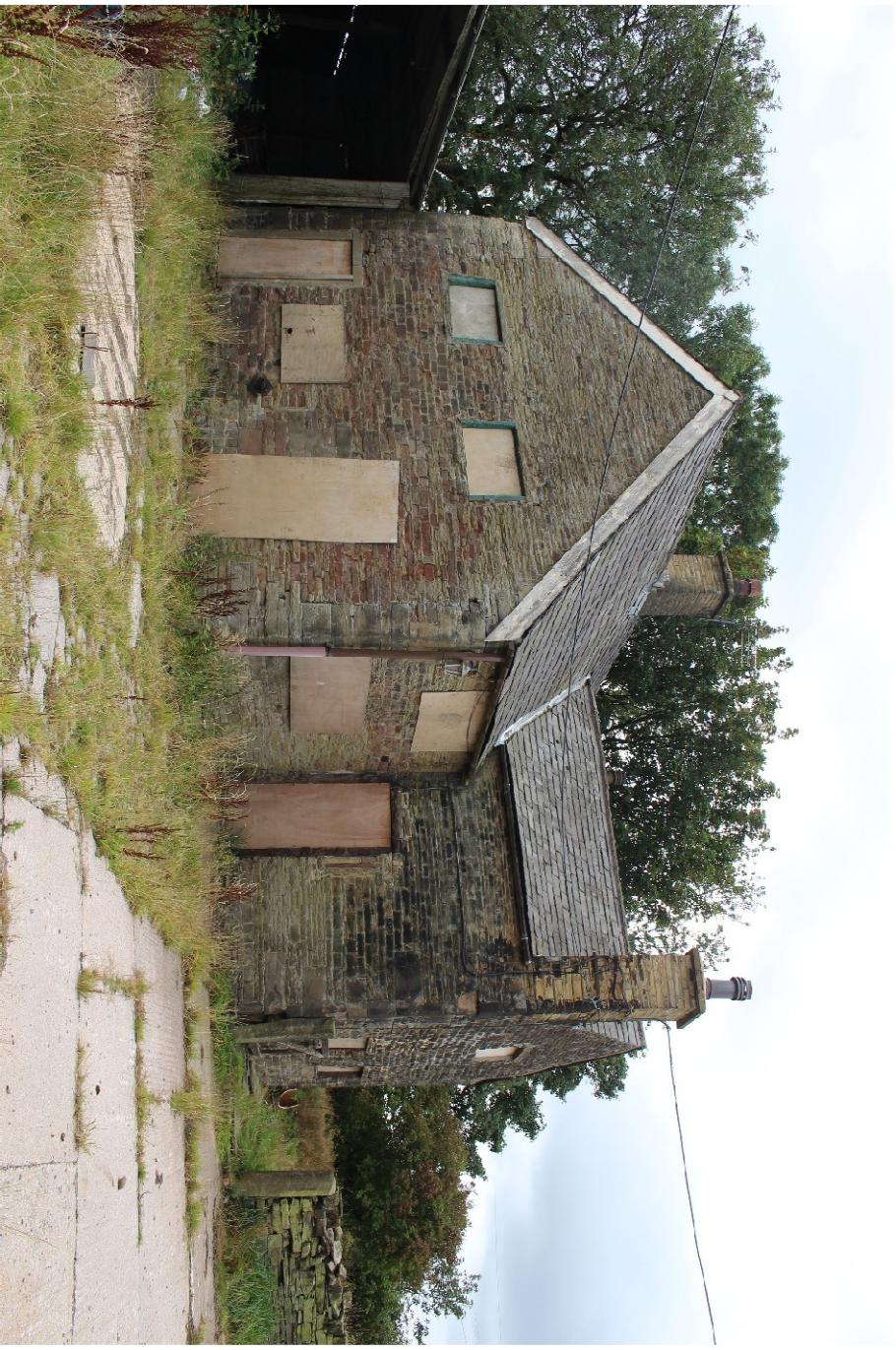
Farmhouse North West Elevation