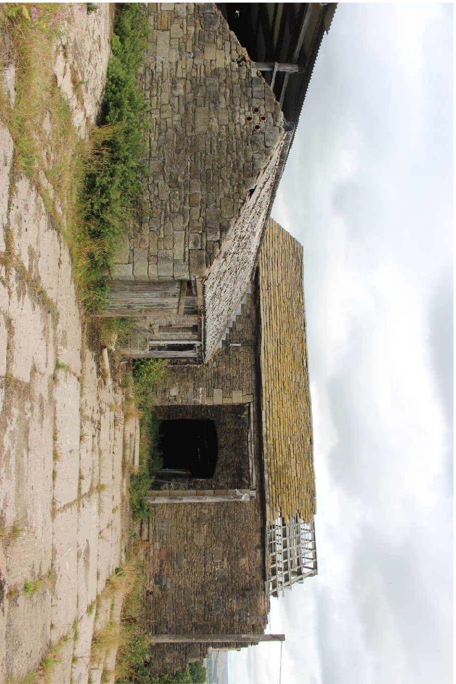
Former Cow Shed