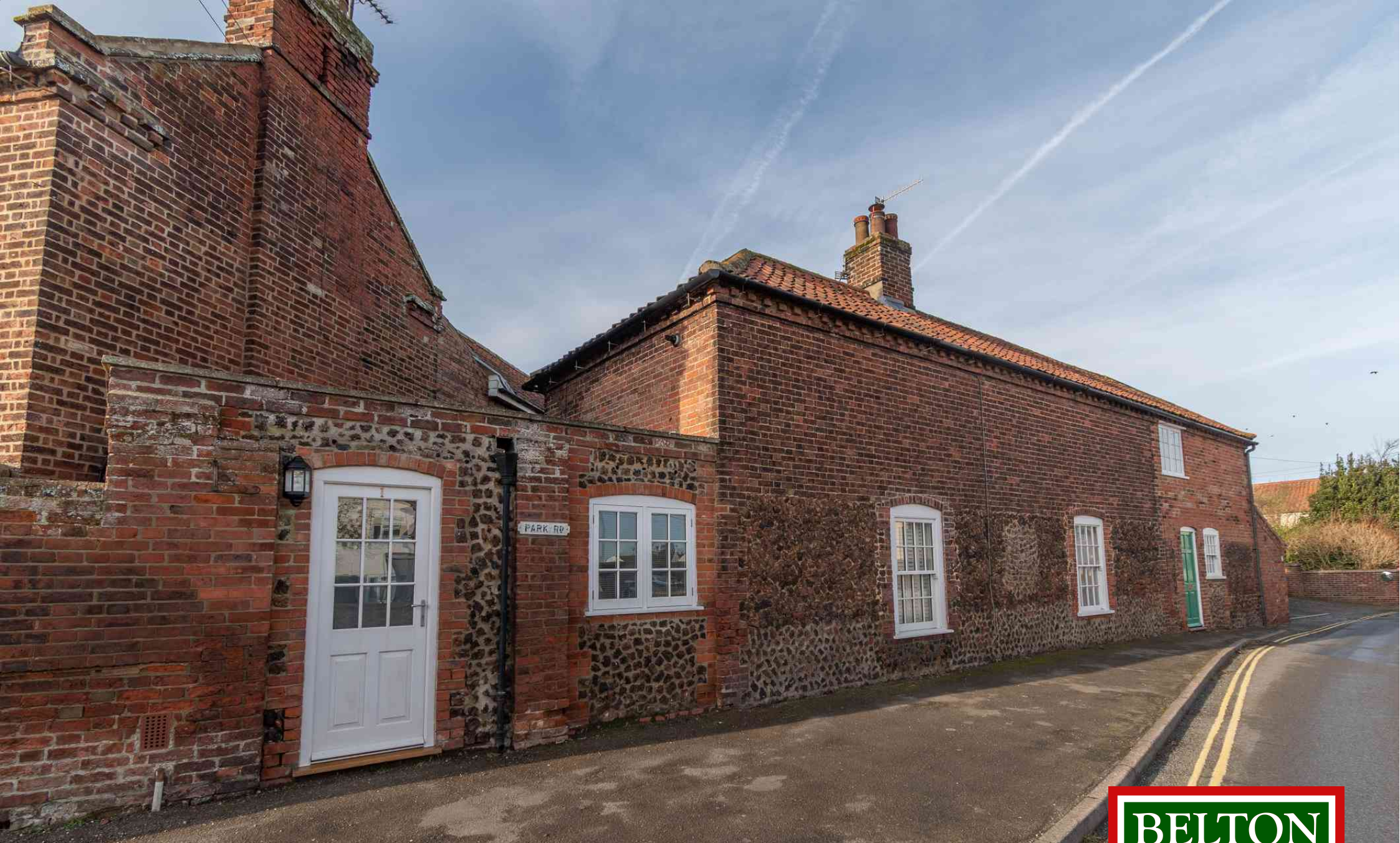
1 Park Road, Wells-next-the-Sea Guide Price £250,000