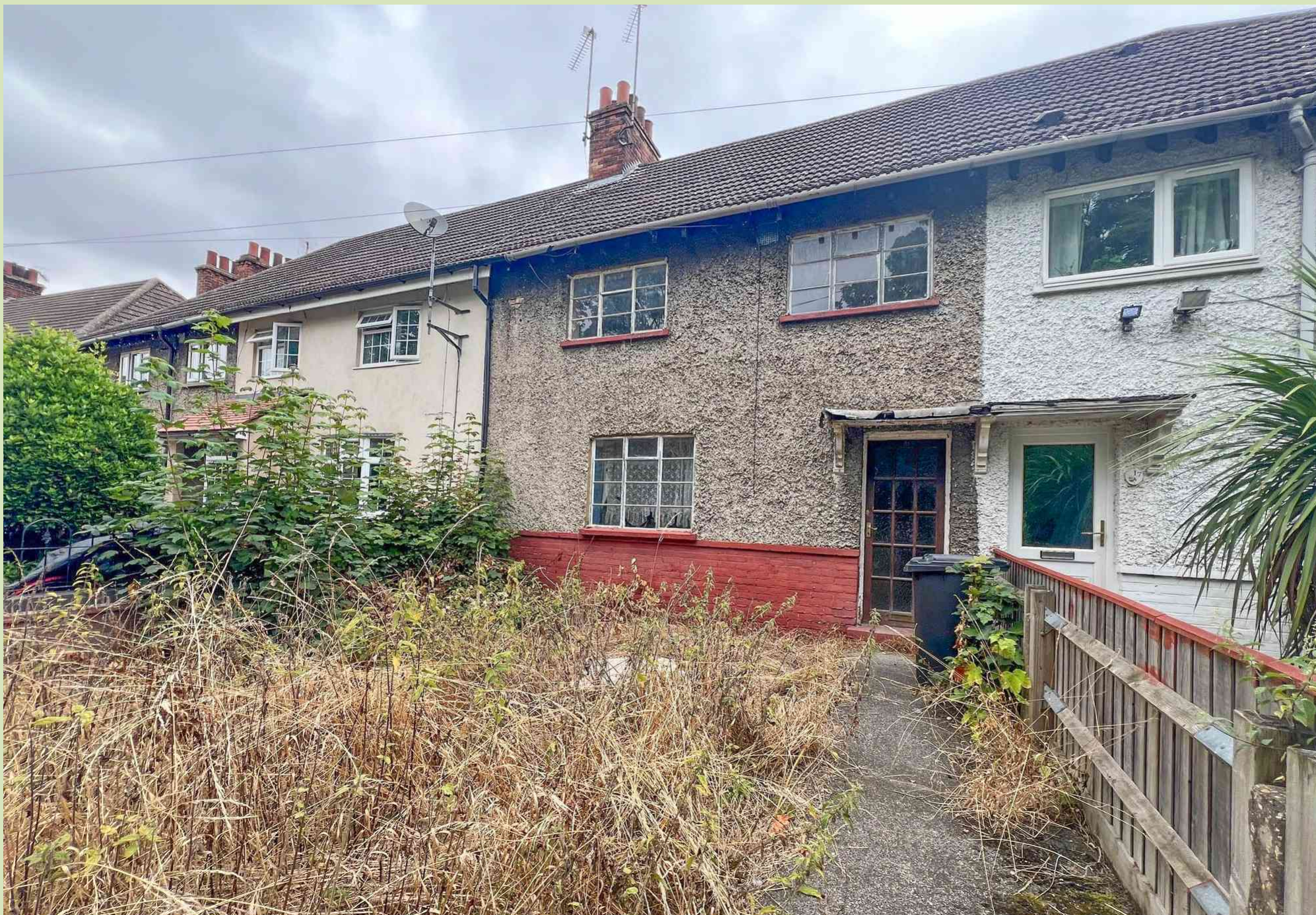
16 Argyle Street, King's Lynn Guide Price £154,995