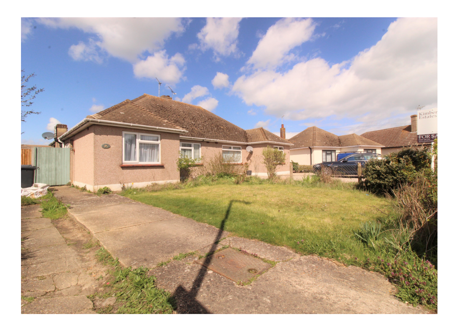
76 Greenhill Road, HERNE BAY, Kent, CT6 7QW