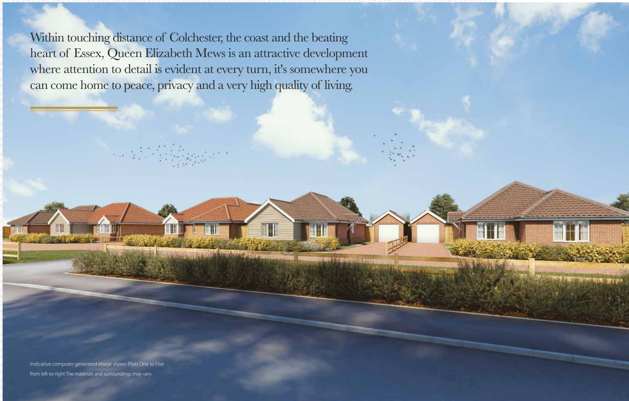
Indicative computer generated image shows Plots One to Five from left-to-right. The materials and surroundings may vary.

Within touching distance of Colchester, the coast and the beating heart of Essex, Queen Elizabeth Mews is an attractive development where attention to detail is evident at every turn, it's somewhere you can come home to peace, privacy and a very high quality of living.