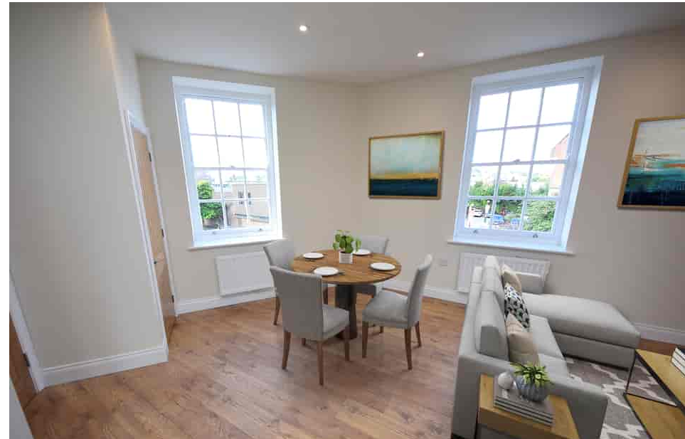
5 The Old Elephant & Castle, Causeway, Banbury, Oxfordshire. OX16 4SN Guide Price £250,000 - Share of Freehold