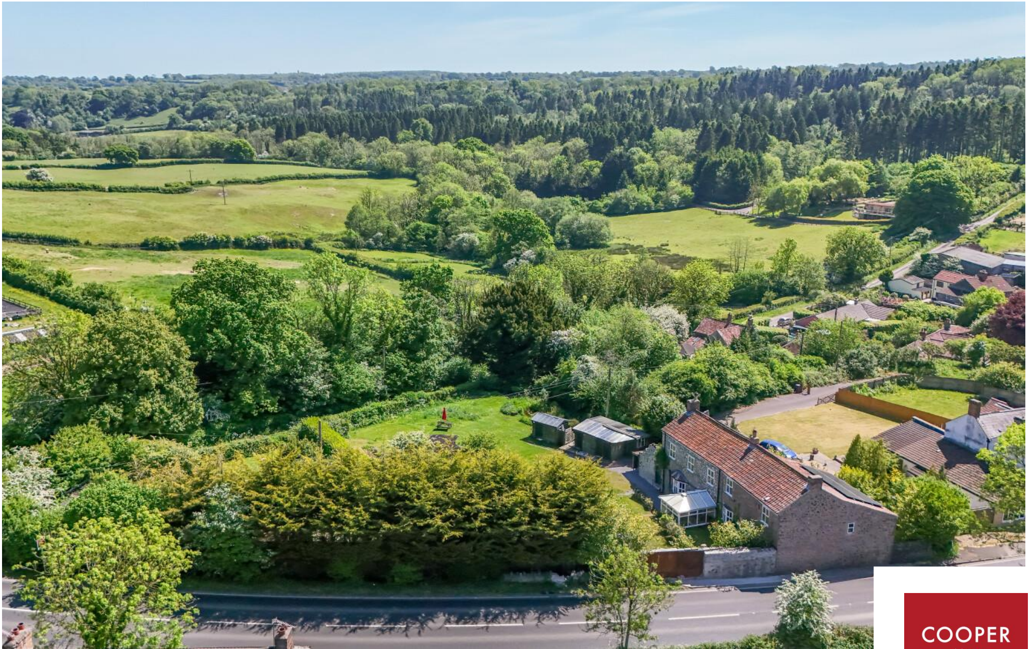
Ivy House, Nettlebridge, Oakhill, Radstock BA3 5AB