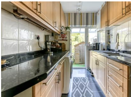
Edgehill Road, Mitcham, Surrey, CR4