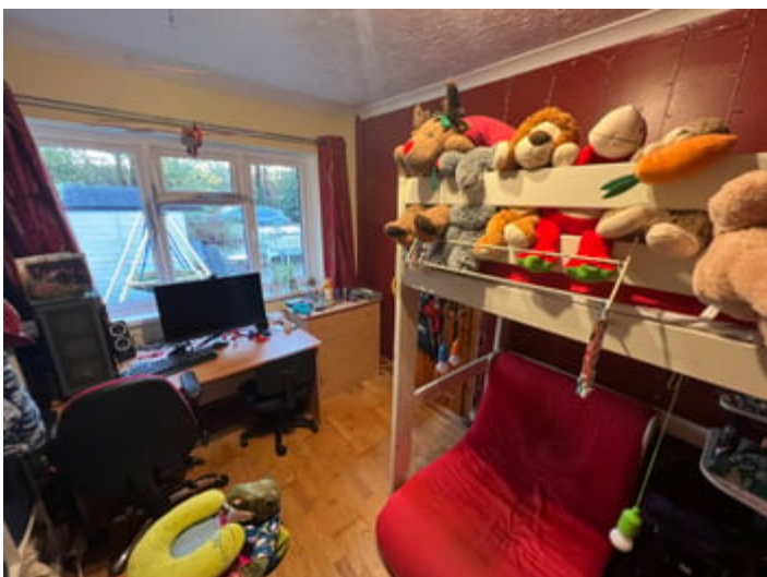
11' 10" x 8' 10" (3.61m x 2.69m) with double glazed window to front, central heating radiator.