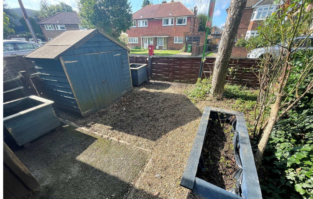
44 Meadowbrook Close, Colnbrook, Slough, Berkshire SL3 0PA £269,950 - Freehold