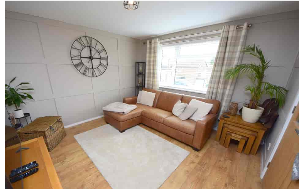
8 Tulbrook Stones, Middleton Cheney, Banbury, Northamptonshire. OX17 2QB Guide Price £385,000 - Freehold