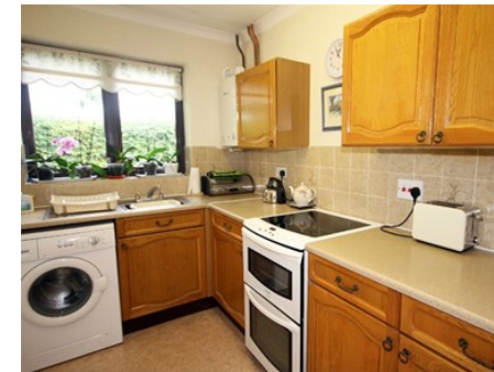
4 The Rickyard Norton Hall Farm, Letchworth, SG6 1AW