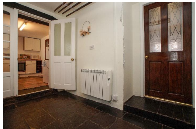
INNER HALL/DRYING ROOM

BATHROOM (8'7 x 7'2) WC, wash hand basin, tiled splashbacks, panelled bath with electric shower over, heated towel rail, tiled walls, electric radiator, tiled flooring and velux window to the rear.