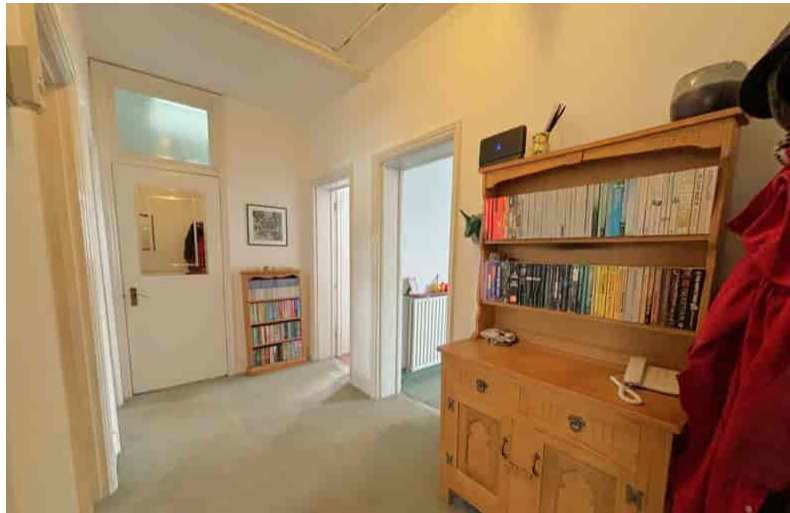
TOP FLOOR FLAT 729 sq.ft. (67.7 sq.m.) approx.